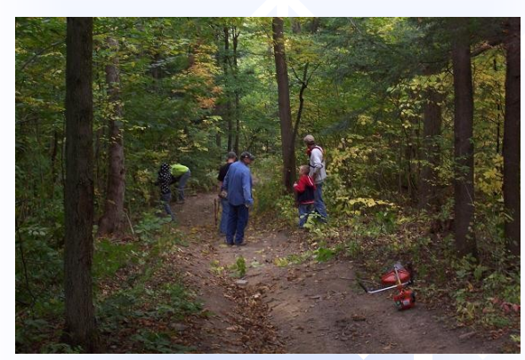
Typical work party in full swing.