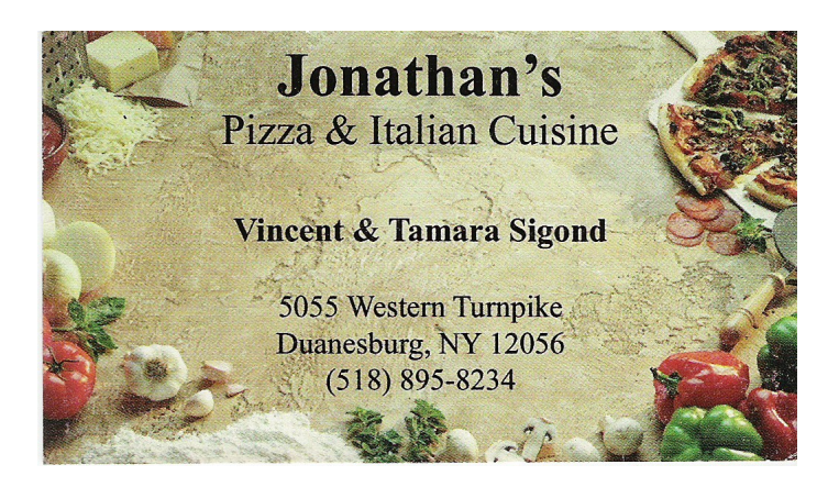
(conituned from page 1 - )

work is part of being in a snowmobile club. If we all do a little, a lot can be done.