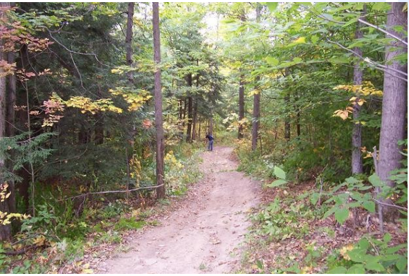
This section of trail is nearly finished being brushed and cleared

set of gloves, protective boots, and be able to cut or haul brush away from the trail. Chainsaw operators are welcome to bring their own equipment. If you are NYS chainsaw safety certified, even better as chainsaw use on state owned land can only be by those certified.