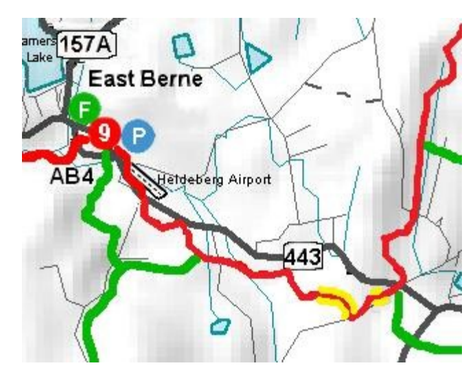
S70 near Rt443 and Brookhaven Rd

The red trail lines with sides of yellow are the sections that we have been working on this fall.